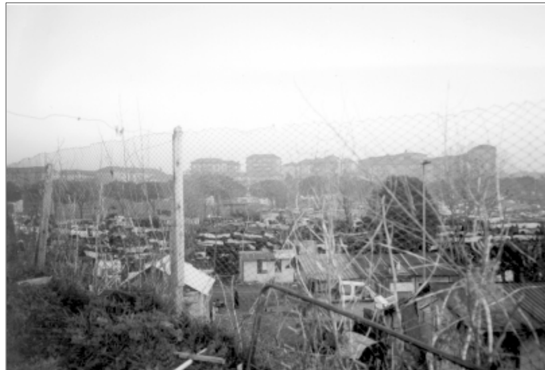
Casilino 900 camp, Rome. In the 1970s, Roma from ex-Yugoslavia lived here in shacks, together with poor immigrants from Calabria and Sicily. The latter received housing in the blocks of flats in the background, when the shacks were bulldozed by the authorities. The Roma, however, received nothing and built new shacks.