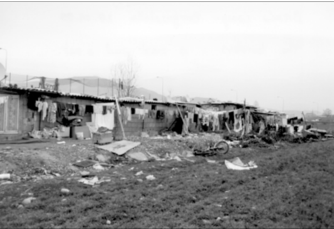
The Borgosatollo camp in Brescia, January 29, 1999.