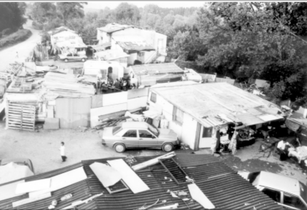
Camp on the outskirts of Florence, May 1999.