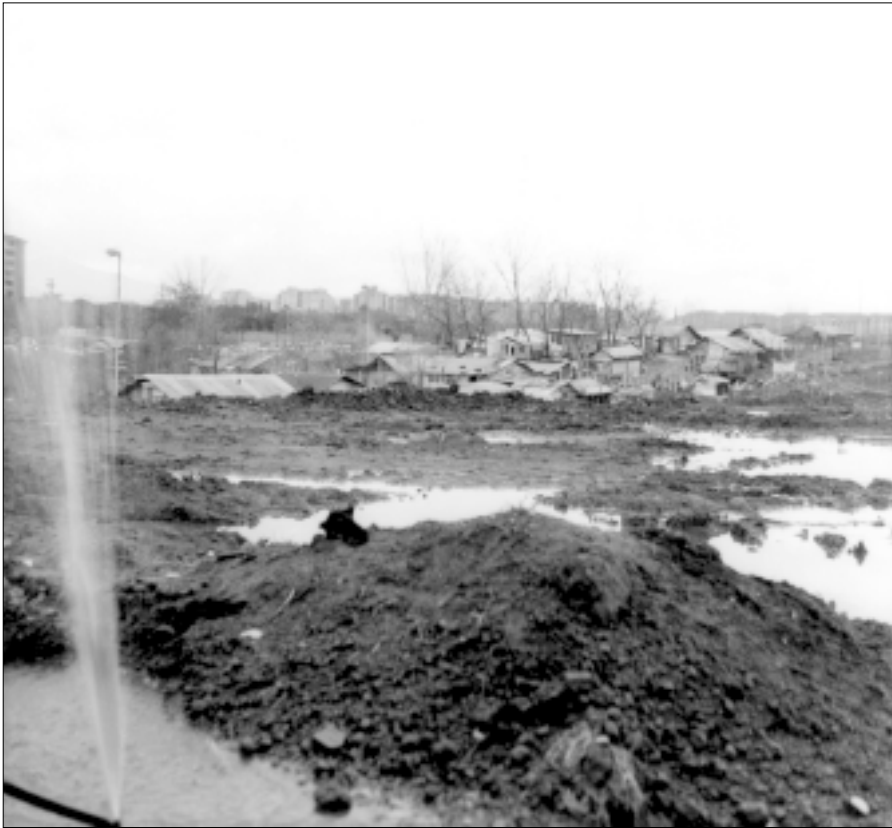
A broken water pipe in Casilino 900 camp, February 24, 1998.