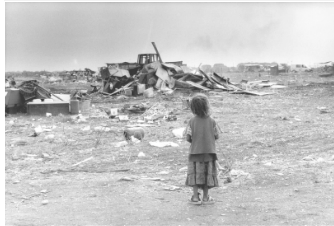
Destruction of Romani dwellings, Casilino 700 camp, Rome, Italy, September 1999.