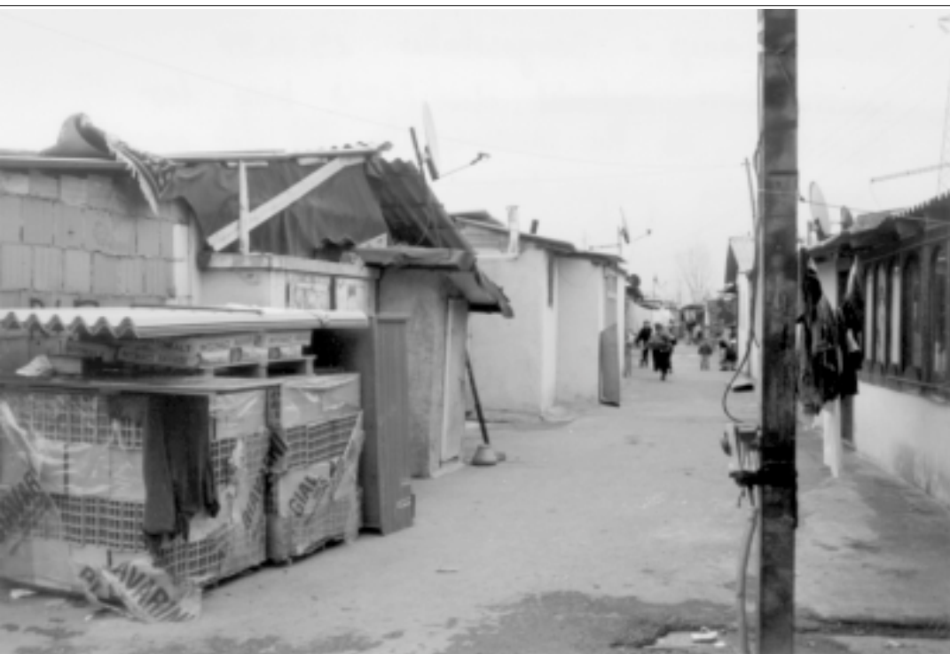
The Borgosatolo camp in Brescia, January 1999: housing built with no municipal assistance. There is no adequate sewer system in the camp.