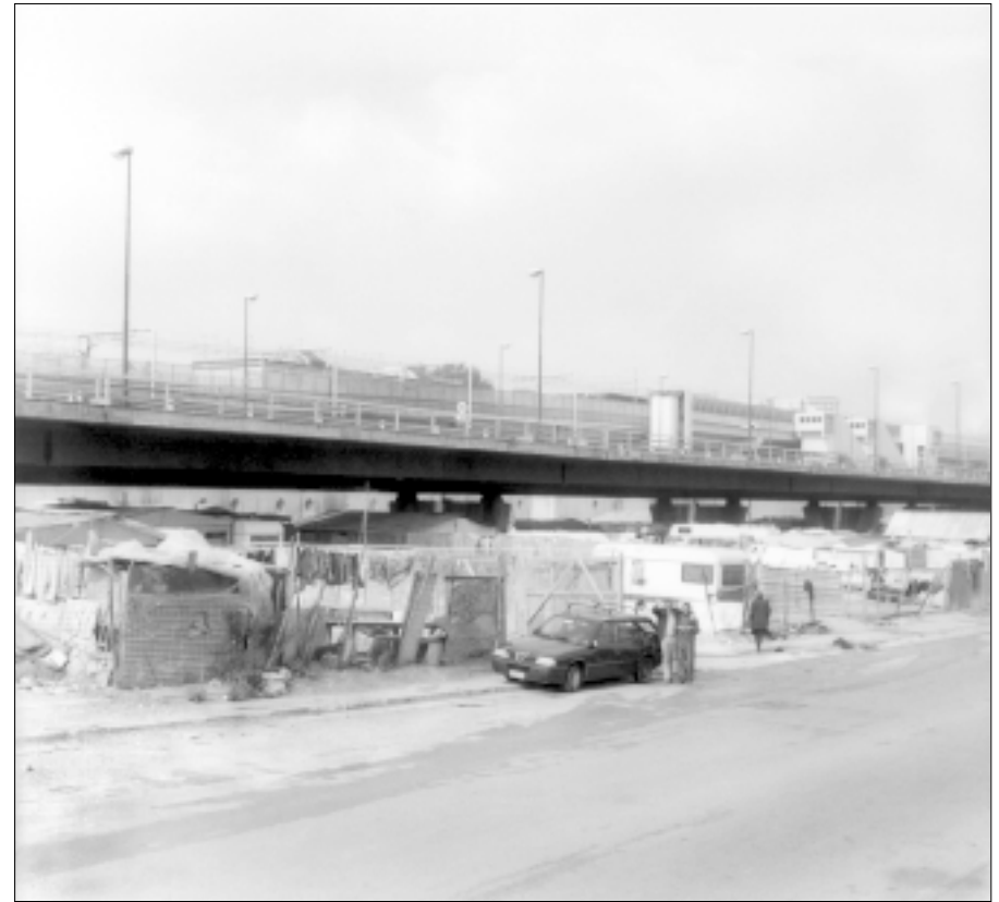
Unauthorised camp in Naples, Italy, April 1, 1998.