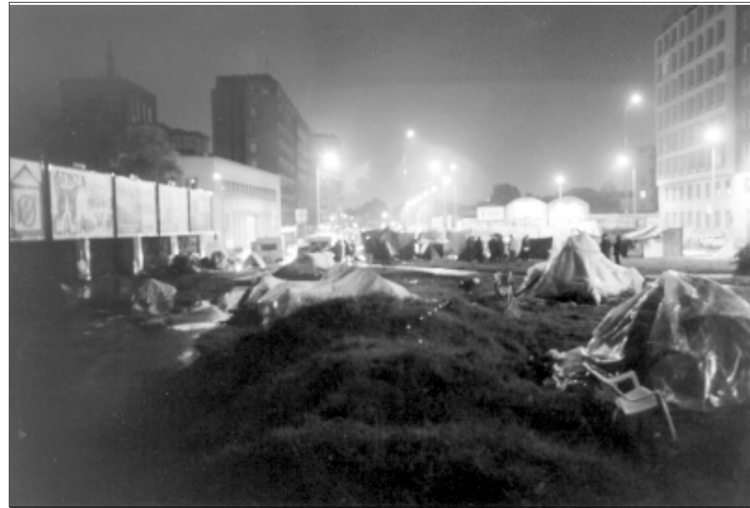
Milan, April 1999: Roma sleeping on the street after having been expelled by municipal authorities from houses in the Via Castiglia.