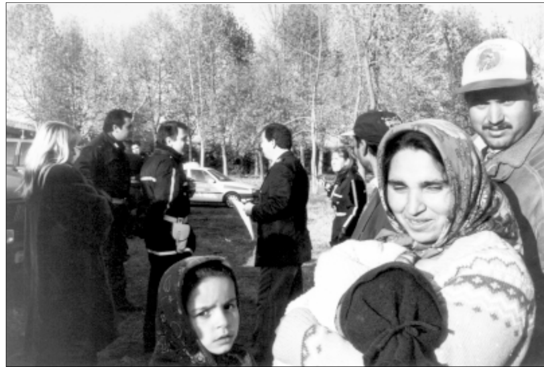
Romani couple in the Germagnano street camp just outside Torino, northern Italy, November 23, 1998. The man in background is a police officer. On the day of the ERRC visit, officers came and compiled lists of local Roma, including photographs and fingerprints.