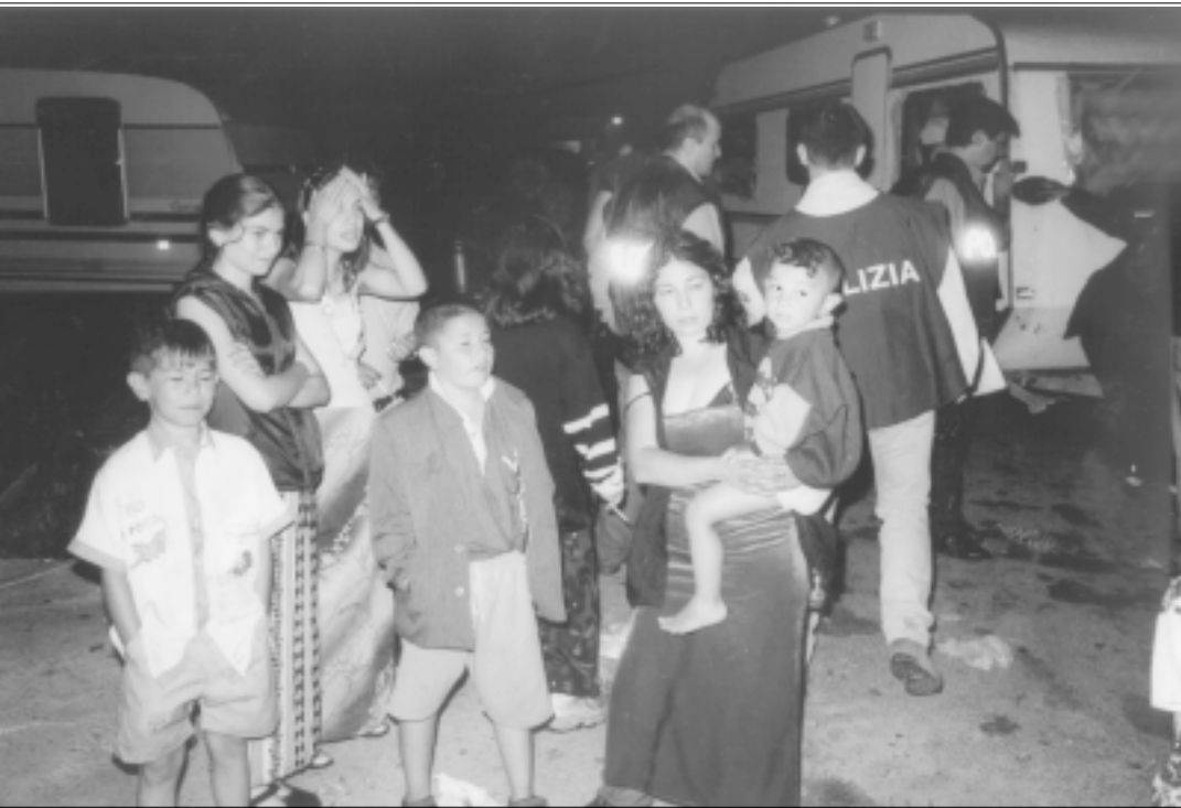
Police raiding the Romani camp on Muratella street in Rome, Italy, May 2000.