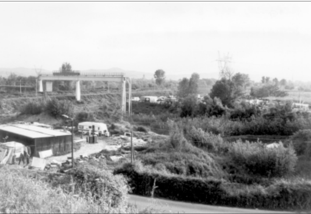
Camps outside Florence, May 1999.