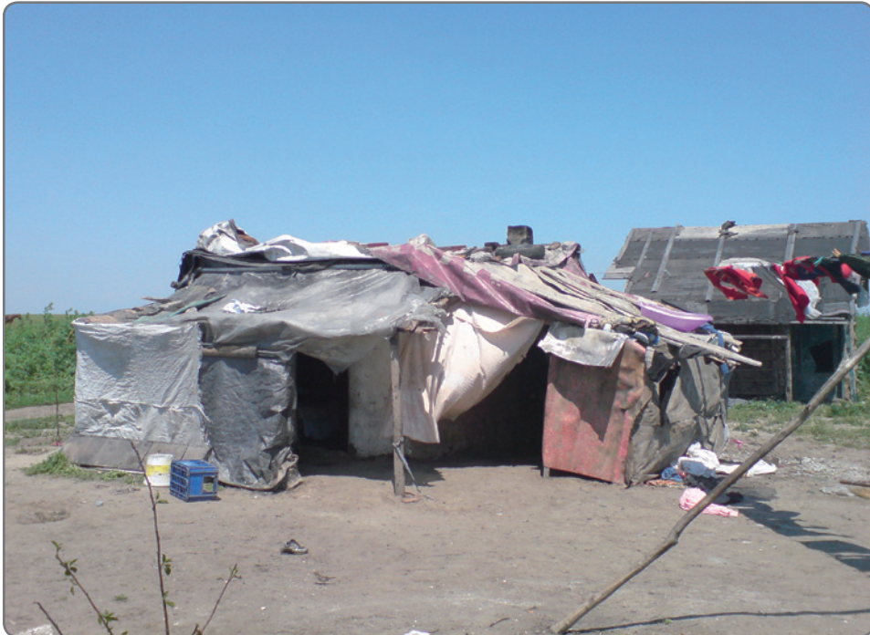
A 60-year-old Romani woman and four minors live in this shack located in the village of Dobreni's Romani settlement in Giurgiu County, Romania.

The housing conditions prevailing in many of the communities visited in this study were highly substandard. The housing of many Roma continues to be characterised by a lack of basic services and infrastructure, such as water, electricity, and sewage or garbage removal. Many Roma live in improvised homes built of collected wood, metal, cardboard and other materials which do not protect the residents against the elements. Some communities are located next to garbage dumps or other hazardous areas, posing health threats to the people living in the communities. The roads in these communities are often unpaved and can be