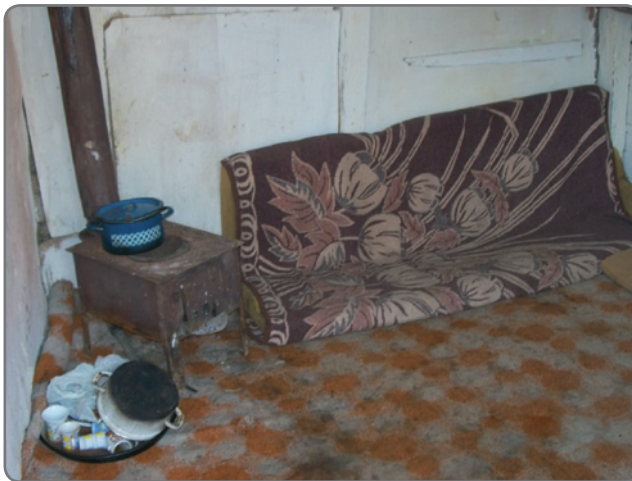
In Veles, Macedonia, Roma live in highly substandard conditions without proper heating or other utilities.

Many Roma are unable to access adequate housing because it is not affordable for them. The CESCR states that the “Personal or household financial costs associated with housing should be at such a level that the attainment and satisfaction of other basic needs are not threatened or compromised. [...] State parties should establish housing subsidies for those unable to obtain affordable housing.” 138 The right to adequate housing is not fulfilled if the costs are so high that individuals cannot access housing or if paying for housing renders them unable to afford to fulfill other basic human needs such as food. Moreover, affordability of housing refers to both the cost of the housing itself (i.e. rent) and the cost of services which are essential to adequate housing, like electricity and water.