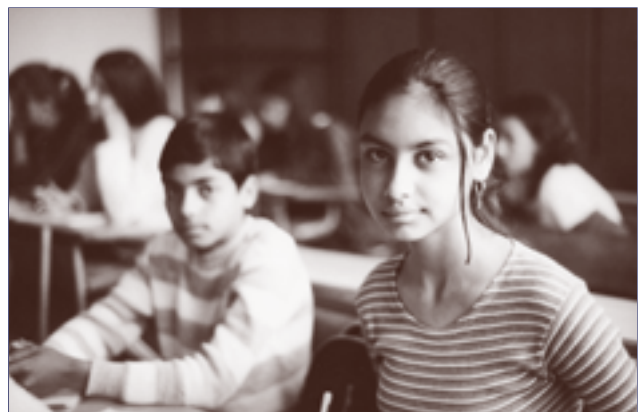
20 Seventh-grade math class at "Hristo Botev" school

The Vidin Model as outlined in this paper is one that can be replicated across Bulgaria. The importance of the preparatory phase cannot be overemphasized: raising awareness among Roma parents, media campaigning, and open dialogue with the authorities, the teachers, and the broader public were absolutely vital components in building partnerships in support of desegregation between Roma and non-Roma. Within Drom, teamwork and detailed planning, down to the finest detail, was essential because one of the organization's main concerns was the emotional and physical well-being of each child participating in the initiative—to ensure that the new educational experience would be both rewarding and enjoyable for them. At all stages Romani parents were closely involved in the process and for the first time they felt empowered to have some say in the education of their children. Their enthusiasm and active participation refuted the pervasive stereotype that Romani parents care little about their children's education.