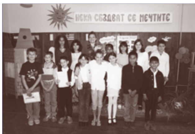
5 "Let your wishes come true" reads the sign above this fourth-grade class at its end-of-year celebration.

directors; parents; and media representatives. This event was very successful in provoking discussions and adding an impetus towards building partnerships with a shared goal to improve the quality of education and support for the process of desegregation. As a result of the seminar, Drom held further meetings with the school staff and, importantly, with the teachers working with the newly integrated classes. Formal agreements for cooperation were signed between Drom, the Regional Education Inspectorate, and the school directors for further organizational and educational support for the process. In December 2000 and January 2001, Drom, in cooperation with the Inspectorate, held a series of training seminars for the teachers on multicultural education, ethnic tolerance, and the history and culture of minority groups.