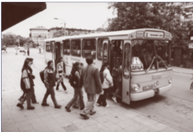
7 Pupils file onto the bus at the end of another school day at "Otet Paisiy."

One of the major concerns of everybody involved in the desegregation initiative was the emotional welfare of the children—that they would not suffer any stress or humiliation in the new schooling environment. Due to the attention of the supervisors and the positive attitude of the teachers involved, the process of adaptation was remarkably smooth. It became obvious very soon that the children enjoyed the change and thrived in their new learning environments. The students were distributed in six mainstream schools in Vidin, on the basis that there not be more than 30 percent of students of Roma origin in any one class.