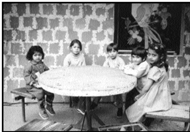
Roma children at a primary school near Belgrade, Serbia

Serbian children often attend fee-paying kindergartens before beginning school, however it is rare for Roma children to have such an opportunity. There are less than 20 private kindergartens in Serbia for Roma children. These are funded by humanitarian organizations and are often